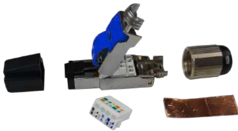
P/N : AL-1145S