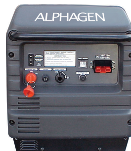
AlphaGen front view