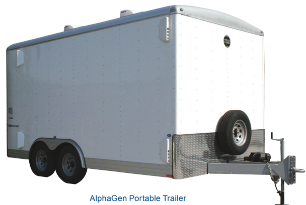
AlphaGen Portable Trailer

For contact information visit www.alpha.com