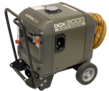
AlphaGen with optional Wheel Kit with Locking Handle and optional canvas cable bag