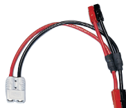
Y-Adaptor Battery P/N 874-946-22