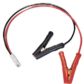
Alligator Clamp Battery Interface P/N 874-946-20