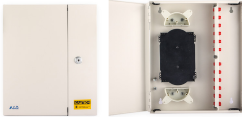
P/N : WIS-0.9-24F-FC