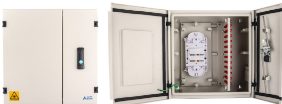
P/N : WIS-1.2-60F