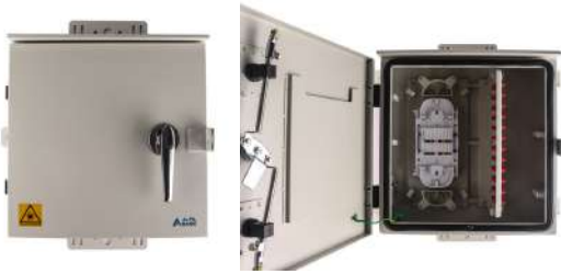
P/N : WOA B48F