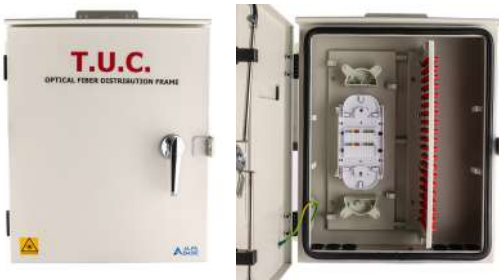
P/N : WOA A120F