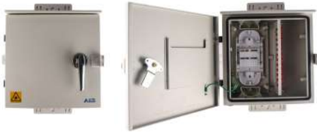
P/N : WOA A24F