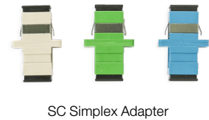
SC Simplex Adapter